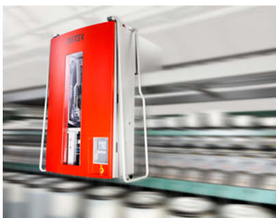
Additional robot on fully-automatic rotor spinning machine

Depending on the produced amount of yarn per hour, the raw material, the yarn count or the quality cuts, the capacity of the existing robots may be exceeded. This results in a lower performance of the rotor spinning machines and thus, in lower production.